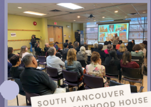
Neighbourhood Advisory Committee (NAC) Meeting and graduation