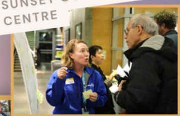
Translink community engagement partnership