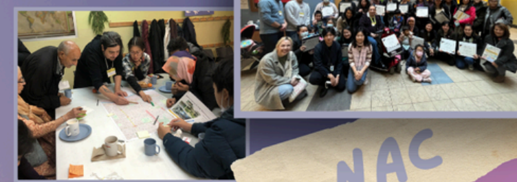
NAC training and engagement