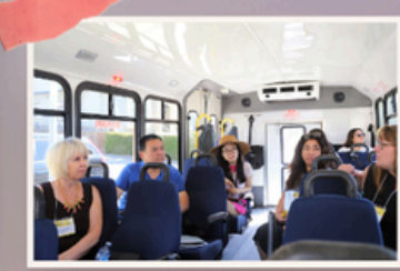
City Councillors explores South Vancouver via bus tour