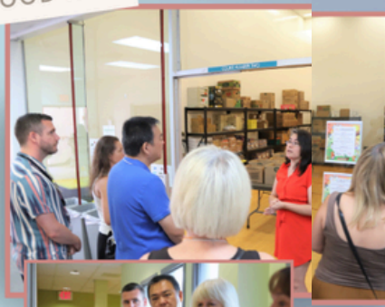
City Councillors visit South Vancouver Neighbourhood House and Food Hub

"Since I started volunteering with the Neighbourhood Advisory Committee (NAC), I have improved my English language skills, met people who make me feel at home, learned about other cultures, and been able to contribute to the amazing community. Thanks to SVNH, I have the opportunity to grow."