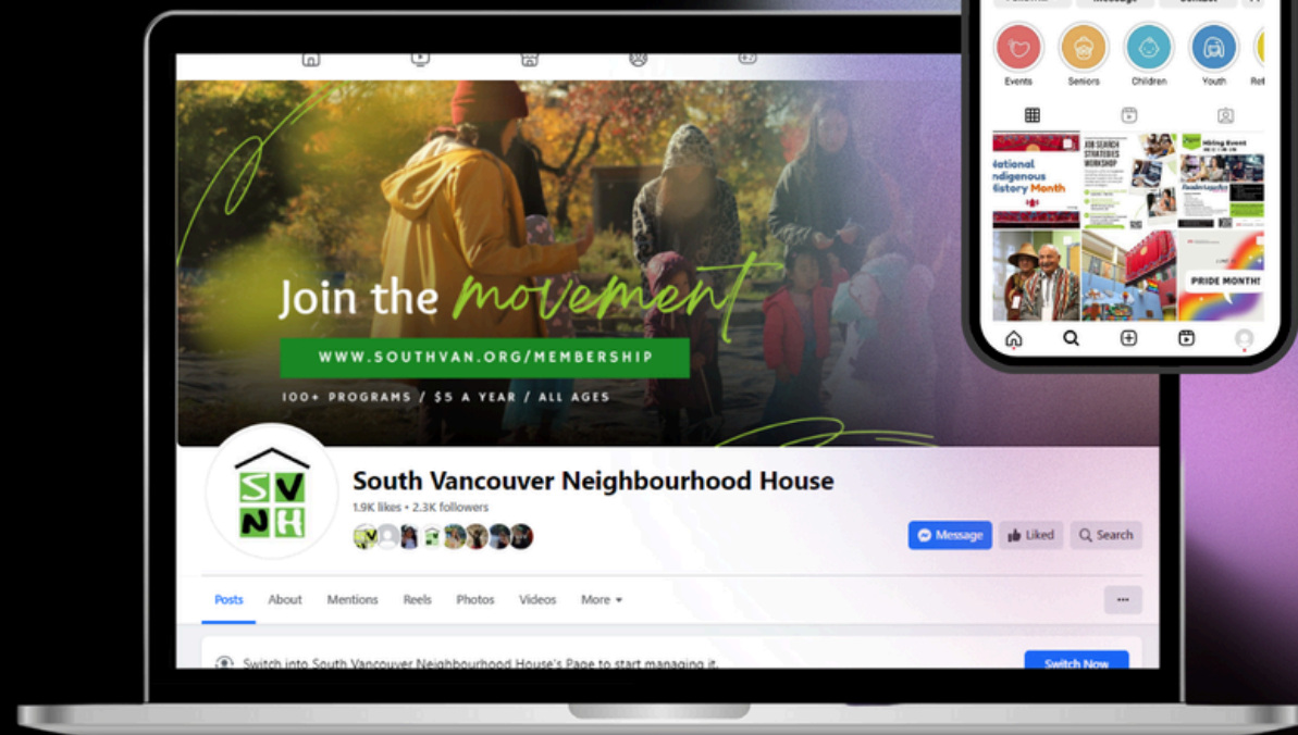
Simplified Membership Form