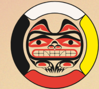
Vancouver Aboriginal Health Society