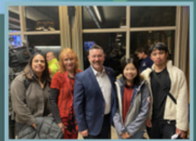
Reframing South Vancouver Team meeting with the Park Board