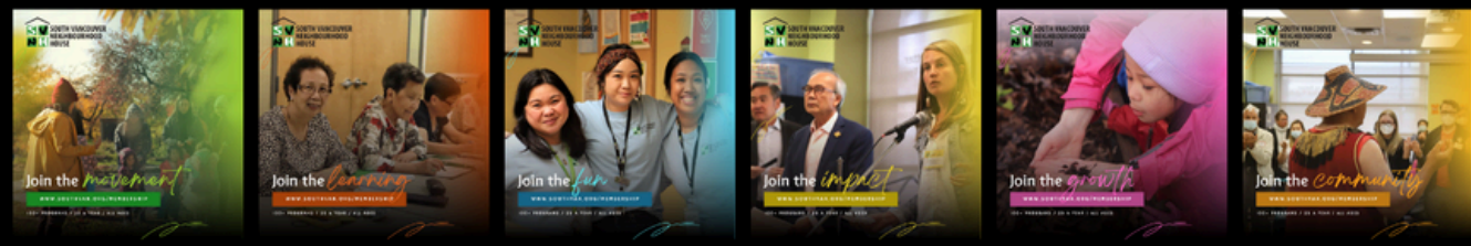
Online and in-person poster campaigns for the Membership Drive to "Join the movement" as a part of the #NeighbourhoodHouseMovement

At SVNH, our goal is to empower our community members to participate in the unique experiences offered at the Neighbourhood House. From January to March, we held our SVNH Membership Drive to promote membership renewal and registration.